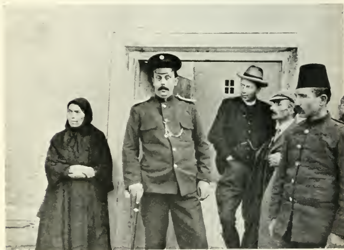
A RUSSIAN CONSUL IN TURKISH ARMENIA